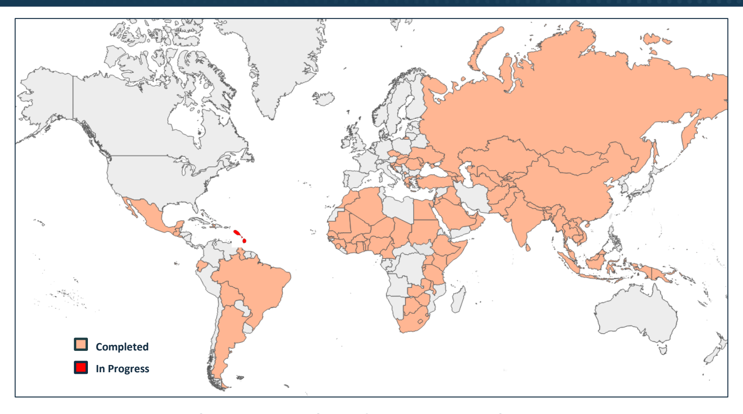
100 countries have completed surveys with TQS integration 30 of these countries with > 1 integration