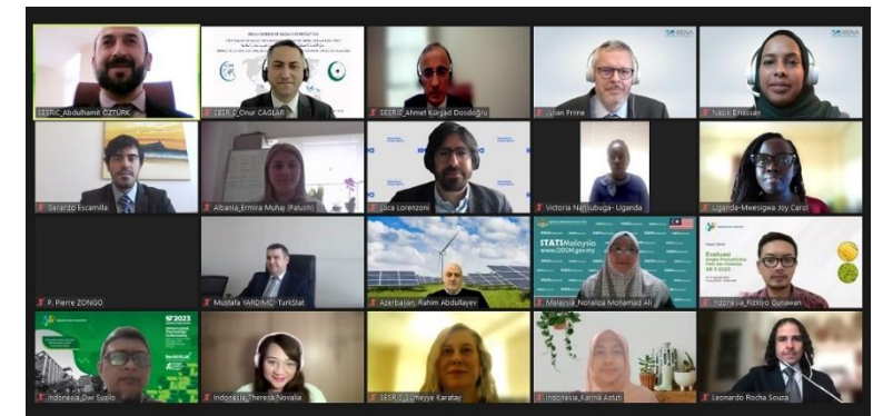
Webinar on 'Renewable Energy Statistics', 28 March 2024