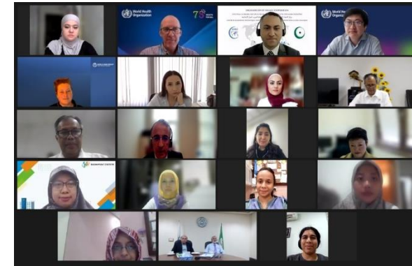
Webinar on "Monitoring Health for SDGs", 30 April 2024