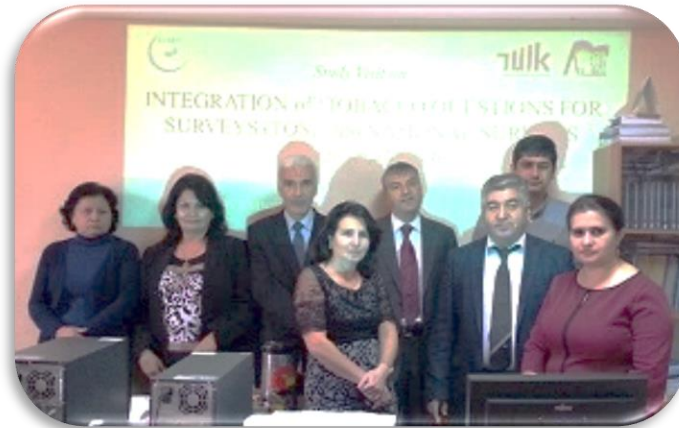
‘Integration of TQS – Sampling Methods’ in Azerbaijan November 2015, Provider: TurkStat of Turkey