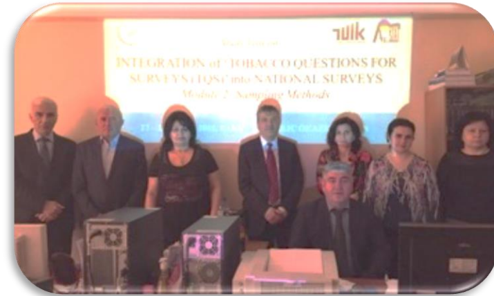
‘Integration of TQS – Module 1: Sampling Methods’ in Azerbaijan April 2015, Provider: TurkStat of Turkey