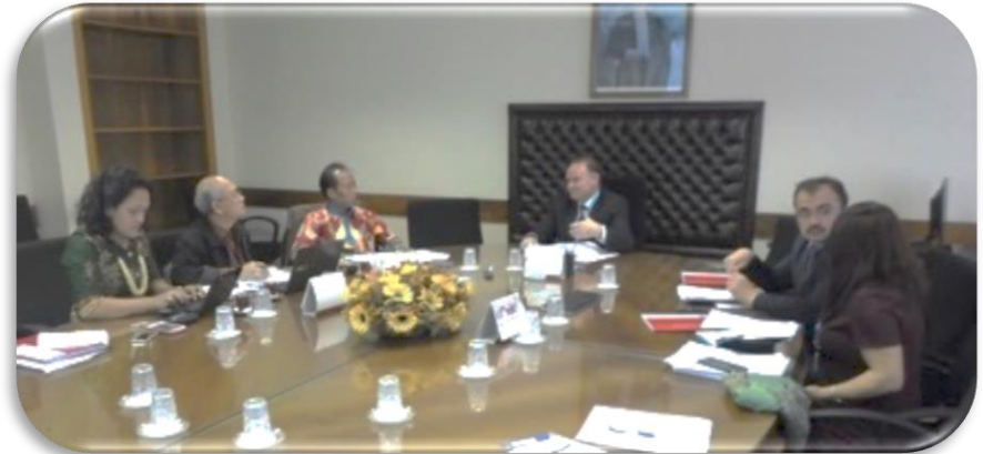
‘GATS and Turkish Health Survey’ in Turkey April 2016, Beneficiary: BPS-Statistics Indonesia