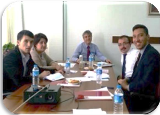
‘GATS and Turkish Health Survey’ in Turkey May 2016, Beneficiary: Agency on Statistics of Tajikistan