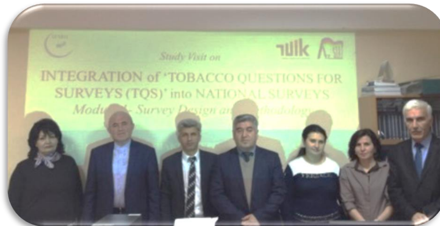
Integration of TQS – Module 2: Survey Design and Methodology’ in Azerbaijan April 2015, Provider: TurkStat of Turkey