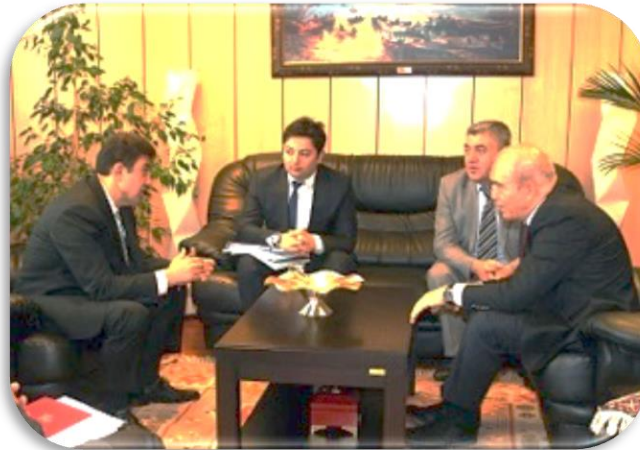
‘GATS and Turkish Health Survey’ in Turkey November 2014, Beneficiary: SSC of Azerbaijan